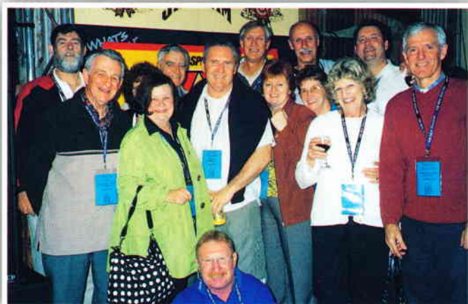
Members of the touring Newcastle Taverners' team and their supporters with Golden Oldies Ambassador and former Test Captain Allan Border at the Queensland Sunshine Coast Golden Oldies Cricket Festival.